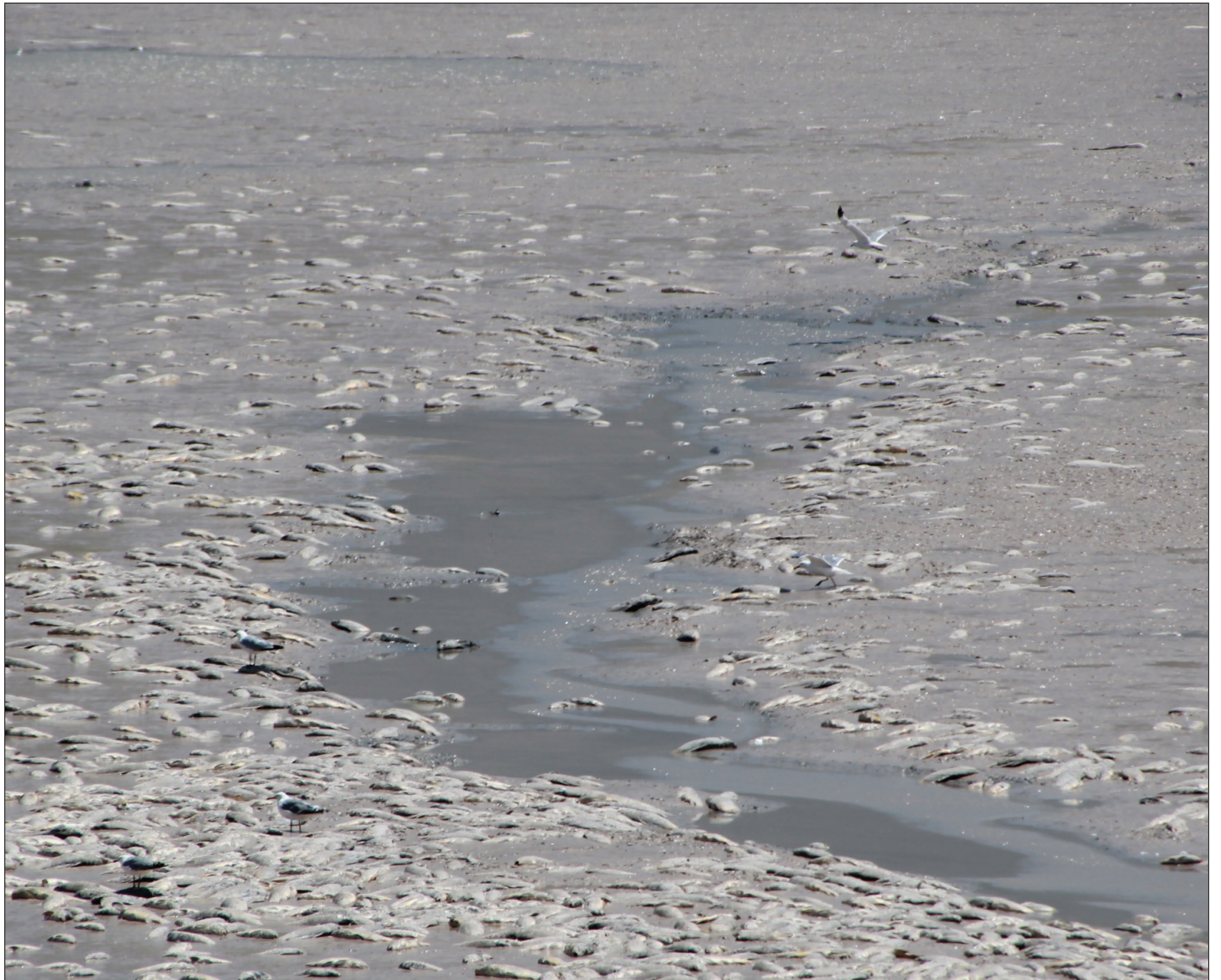
DEAD FISH AND MUD FLATS • The seagulls are busy at Mona Reservoir (Mud Flats) as most of the water is gone and all that is left at the dam are mud flats and dead fish. Just one small stream through the middle is all that's left of this year's water. The state and local government are calling for a 25% cut in water use. Time to start thinking about rocks rather than grass in your front yard.

Utah's baseline rate of water consumption per person, per day, is 295 gallons, according to Utah Division of Water Resources Conservation Program data. Only Nevada uses more.