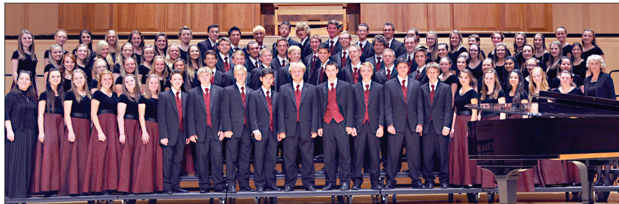
Juab High School Concert Choir

The choir had their Spring Concert on Monday, May 18 where they performed their Superior rated songs for the public.