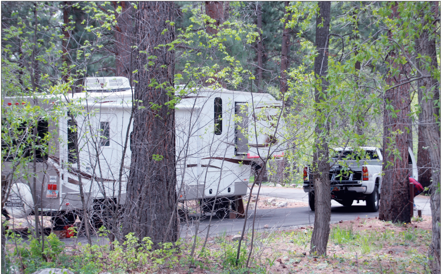
MEMORIAL DAY CAMPING • The first big camping weekend of the summer is now 3 days away and a check of Ponderosa Campgrounds found a few campers moving their rigs into place and a lot of space with reserved signs on them. The weatherman predicts more rain this week and weekend so it might not be a good weekend for tent camping.

He said that Sunroc officials would like to have the speed signs changed to set the speed limit at 35 mph at the area where the merging trucks and